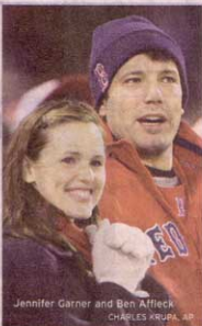
Jennifer Garner and Ben Affleck