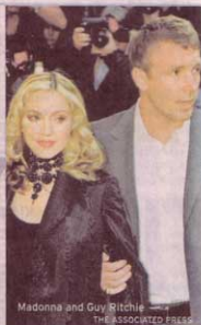
Madonna and Guy Ritchie